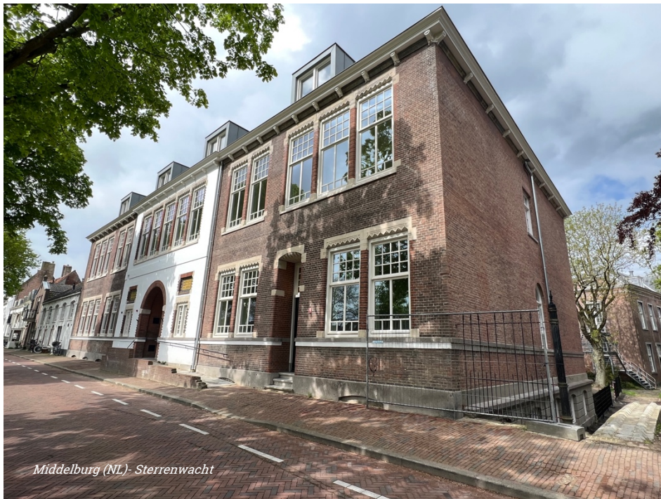
Middelburg (NL) - Sterrenwacht

'We are delighted that the completion of this Dutch care residence will allow us to further increase the share of operational projects in our care real estate portfolio and, consequently, our flow of rental income. This care complex is also our first project in the province of Zeeland.'