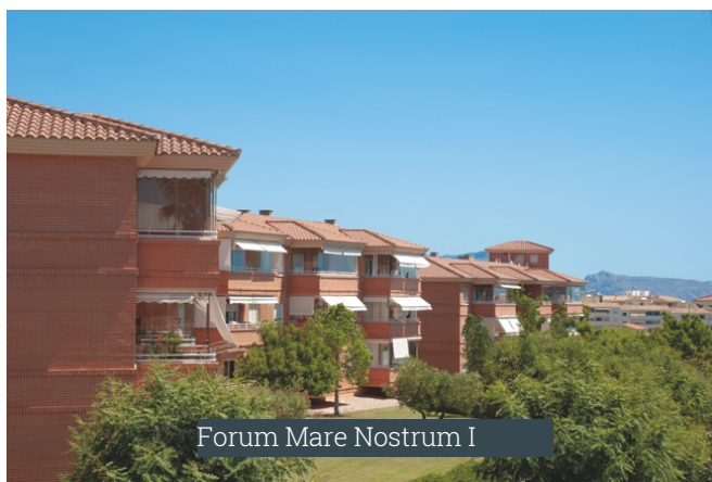
Forum Mare Nostrum I

'This large-scale complex of assisted living apartments is Care Property Invest's largest transaction to date on the Spanish market. The operation of this project will be in the hands of Forum de Inversiones Inmobiliarias Mare Nostrum S.A., a Spanish operator with an extensive track record. Including this project in L'Alfàz del Pi, our property portfolio now totals 129 projects.'